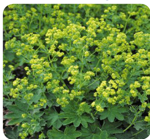
Fig. 1. Representation of the aerial parts of Alchemilla sericata .

Aerial parts of Alchemilla sericata were collected in the Almas height Khalkhal-Asalem road (Ardabil Province in northwest Iran) area at an altitude of 2950 m in July 2015. A voucher specimen (A-121) was deposited at the Herbarium of Agriculture Research in Ardabil Center (HARAC), Iran (Fig. 1).