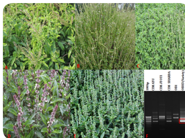
Fig. 4. High ursolic yielder varieties A- CIM Ayu, B- Sel-1 (OB-1), C- CIM Jyoti, D- CIM Snigdha (OBH-3), E- High (-) linalool rich essential oil (78.70%) and medium ursolic yielder variety CIM Shurabhi and their F-SCoT molecular marker profile.

as \hat{h}^2_{BS} was generally very large (93.52 to 99.99) for the eight characters except for primary branches/plant (79.39) and oleanolic acid content (61.98) that showed moderate heritability. In other words, all characters except primary branches/plant and oleanolic acid content were apparently only minimally influenced by environment factors (Table 4). Silva et al. (2008) also reported high variation in ursolic acid content in the eight Ocimum species in north eastern Brazil.