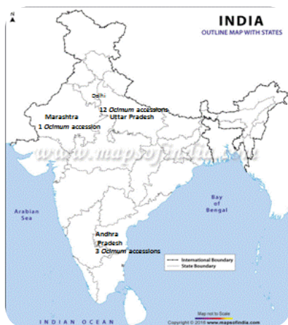
Fig. 1. The geographical map of India with sampling area.

having sixteen genetic stocks of Ocimum from Uttar Pradesh (12), Andhra Pradesh (3) and Maharashtra (1) were included in this study.