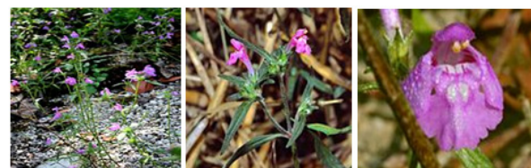
Fig. 1. G. ladanum (left), particular of the leaves (middle) and of the flowers (right).

are collected in verticillasters four by four. They are also hermaphrodite and zigomorphic blooming from June to October. The fruit is a schizocarp formed by four glabrous nuculae. The roots are tapped (Fig. 1) (Conti et al., 2005).