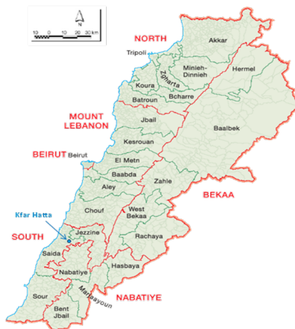
Fig. 1. Geographical map of Lebanon country showing study area (South) with the sampling site (Kfar Hatta village).