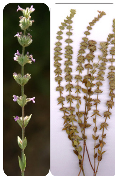
Fig. 2. Satureja myrtifolia plant at flowering period (A) and at maturation stage (B).

Two solvents (water and methanol) were used for the extraction of TPC. 1.0-gram portions from the aerial parts of S. myrtifolia plant (leaves and stems) were powdered and extracted for 24 h with 20 mL of water or methanol (95%) at room temperature (30 °C), followed by rapid paper filtration through a Whatman No 0.45 mm filter paper. The resulting solutions were evaporated under the vacuum at 30 °C by Buchi Rotavapor R-200 to dryness. The residues were then dissolved in 3 mL of water or of methanol. The extraction yields (w:w) were: 24% (water) and 18.65%