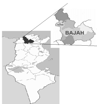
Fig. 2. Localization of sampling area (North Western of Tunisia in Bajah at Amdoun).