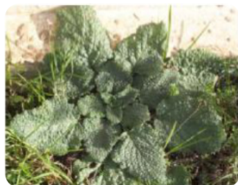
Fig. 1. Representation of mature borage rosette in the sampling area.

Mature rosette leaves of B. officinalis L. (Fig. 1) were collected at 61 days after cotyledon appearing from spontaneous plants in the region of Bajah at Amdoun area (North Western of Tunisia (Fig. 2) under the geographical coordinates of latitude: 36.81° N; longitude: 9.05° E at an altitude of 448 m.