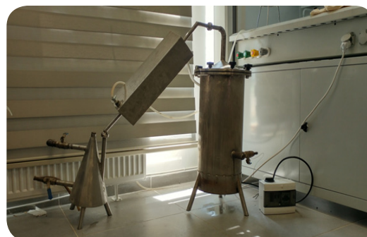
Fig. 2. The distillation apparatus was designed by Ayhan AKPEK for boiling fruit pulps (pictured by Mehmet Ali DEMİRÇİ at Çankırı Karatekin University).