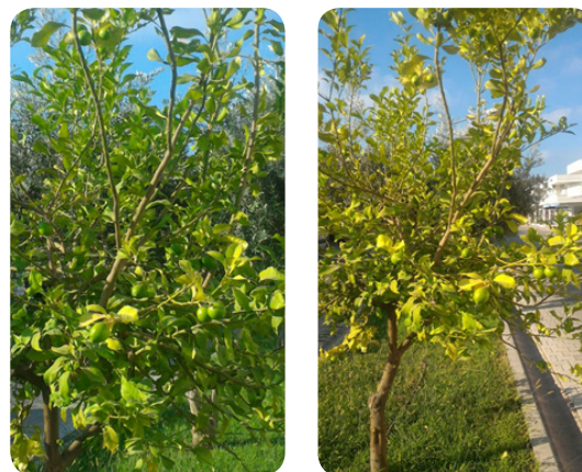
Fig. 1. Lemon trees at early period (left) and at late period (right) show the seasonal differences.

Fig. 2 (Demirtas et al., 2013). The aqueous extract was separated by filtration and extracted with ethyl acetate. This process was continued until significant amounts of the aqueous components were transferred to ethyl acetate. When this process was carried out three times, the extraction was completed with ethyl acetate. The remaining aqueous extract was subjected to extraction in the same manner as n -butanol. The obtained ethyl acetate and n -butanol extracts were separated from the solvent by rotary evaporator to give a dry crude extract. Eventually, 13.2 g of ethyl acetate and 21 g of n -butanol crude extracts were obtained from the lemon pulp.