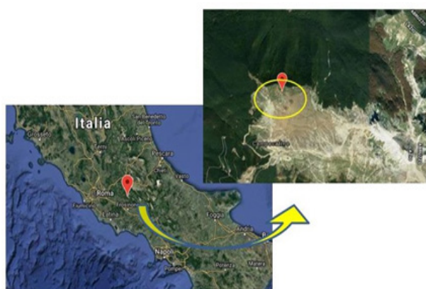
Fig. 2. Satellite view of Central Italy and expansion of the collection area.

All the solvents having RPE purity grade if not differently specified, were purchased from Sigma Aldrich as well as the deuterated solvents and the methanol of HPLC grade, whereas silica gel was purchased from Fluka Analytical.