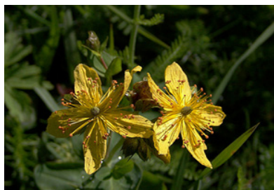
Fig. 1. Flowers of H. richeri Vill.

inhabitants about the use of the flowers of H. richeri Vill. with or without the contemporaneous presence of flowers of H. perforatum L. in the preparation of an ointment. This ointment is obtained by maceration of these plants organs in olive oil and is traditionally used to cure skin disorders such as wounds and burns. Recent studies on the phytochemistry of this species have been mainly conducted on the composition of the volatile fraction (Maffi et al., 2001; Ferretti et al., 2005; Maggi et al., 2010) from Italian and European accessions, mainly of Balkan origin (Smelcerovic et al., 2007). The analysis of the polar fraction revealed the presence of flavonoids, naphthodianthrones and phloroglucinols (Maffi et al., 2001; Smelcerovic and Spiteller, 2006). Also, the biological activities as antioxidant (Zdunić et al., 2011), antimicrobial (Maggi et al., 2010), anti-inflammatory and gastroprotective (Zdunić et al., 2010) agents have been explored in recent times.