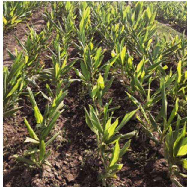
ii) Clay loam soil field view