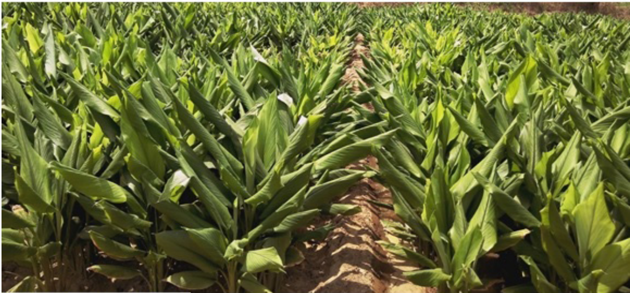
ii) Sandy loam soil field view